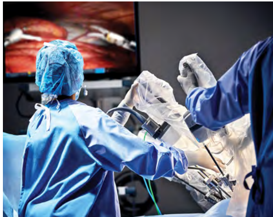
State-of-the-art robotic technology for orthopedic surgery is one of the ways in which Weiss Memorial Hospital is investing in expanded clinical programs.