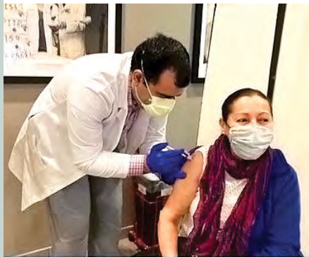
Weiss Memorial Hospital staff have provided COVID-19 vaccinations to more than 10,000 local residents.

More recently, the COVID-19 pandemic has presented significant challenges to our hospital and to hospitals across the country. In our Chicago-area community, I am proud that Weiss Memorial Hospital not only remained open to care for patients, but also made progress in important revitalization programs to enhance patient care going forward.